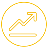
Sales & Marketing

Over the years in a close collaboration with our Pharmaceutical Partners, we develop a integrated service of Taylor made solutions for Sales & Marketing, Distribution, Medical Services, Regulatory services and registration, Logistic & Warehousing, Compliance Program, Pharmacovigilance, Quality assurance and License-out.