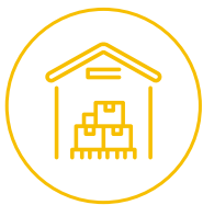
Logistic & Warehousing