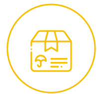
Regulatory services and registration